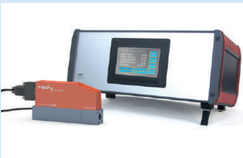
Fig. 4 Process Control Unit PCU-10