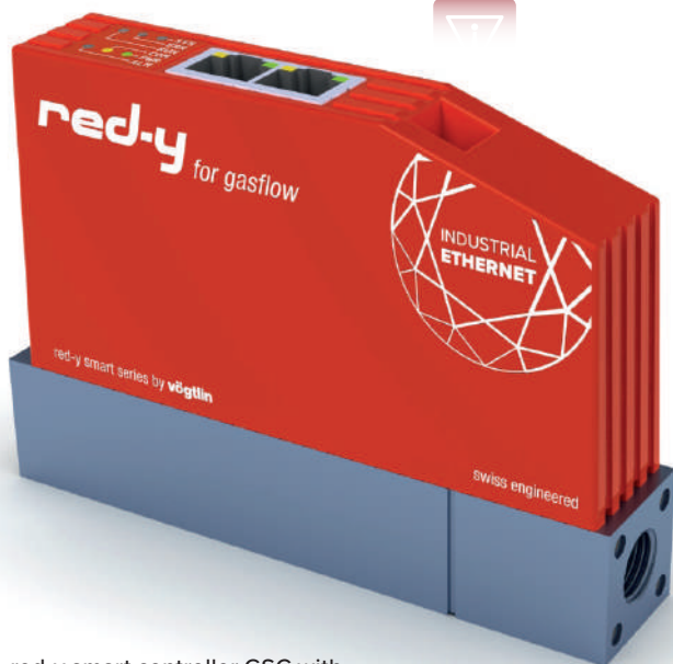
Fig. 1 red-y smart controller GSC with Industrial Ethernet interface at the top of the device