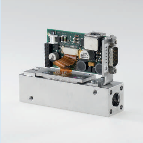
Fig. 3 High-tech in a very compact design: The flow meters and controllers use advanced MEMS technology

Through the application of high-precision MEMS technology (CMOS sensors), the thermal flow meters and controllers from Vögtlin Instruments GmbH set new standards in terms of response characteristics and measuring accuracy, and are characterized by maximum convenience: