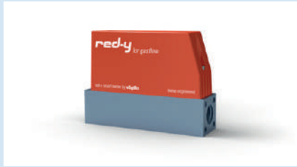
smart meter GSM Thermal mass flow meter