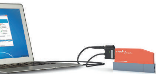
Fig. 2 Configuration of the devices via the free get red-y software