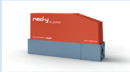
smart controller GSC Thermal mass flow controller