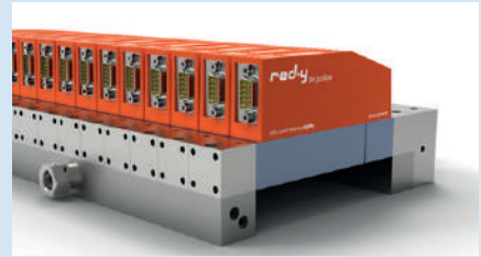
OEM version For customer-specific requirements