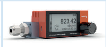
Various Inlet and Outlet Fittings