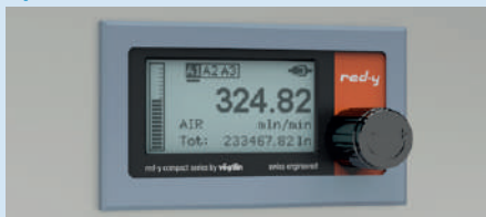
Panel Mounting Kit