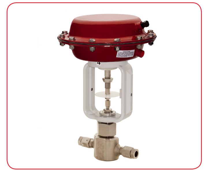
Type 1711HD Valve